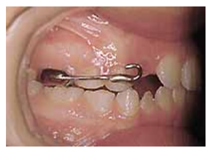
Virtual Journal of Orthodontics Copyright © 1998 All rights reserved.